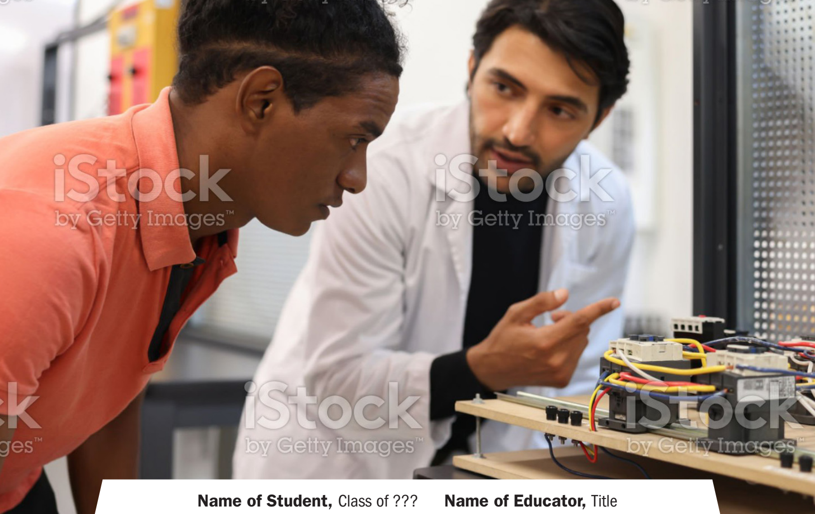
Name of Student, Class of ??? Name of Educator, Title

Story text goes here. Sequi son commodit esed ut volorrovit apic tores plis ut quiam que lignienda qui totatiam volestia ad qui nonsequatur?